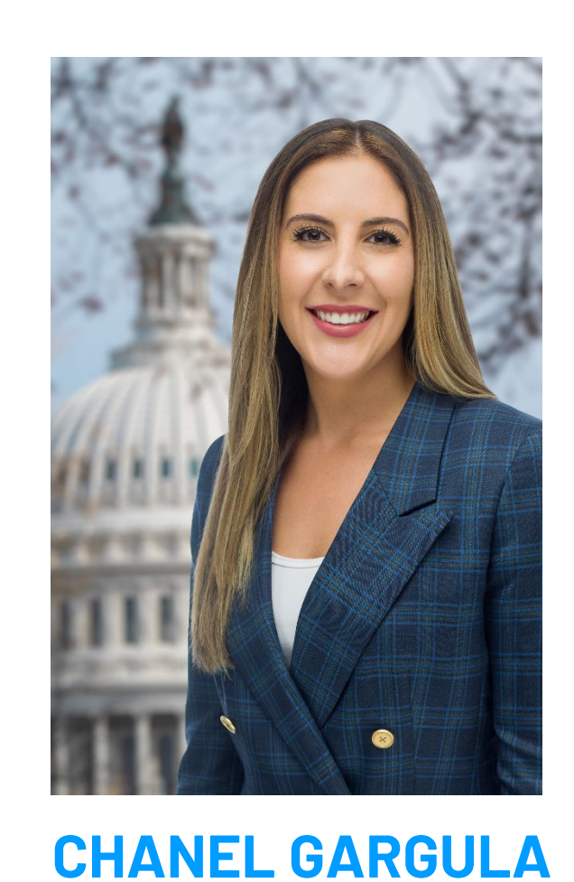
Solutions Director "ONE PART EXPORT CONTROLS, TWO PARTS EXECUTION STRATEGY, WITH A GARNISH OF TEAM SPIRIT.